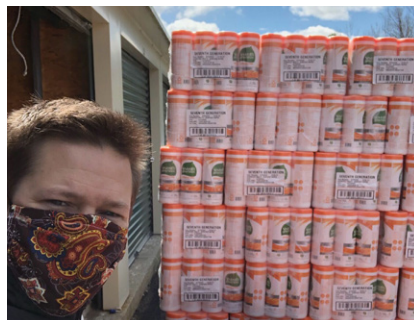
SEVENTH GENERATION DONATES CLEANING SUPPLIES