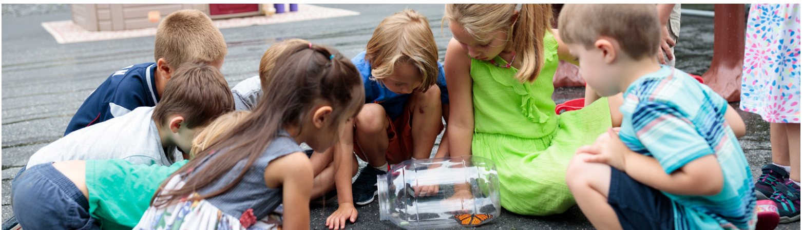
PHOTO: CHILDREN WATCH A BUTTERFLY EMERGE FROM ITS CHRYSALIS AT MISS ROBIN'S NEST, MONTPELIER, VT

READ FULL REPORTS ON CHILD CARE ACCESS AND AVAILABILITY, PLUS WORKFORCE DEMAND, AT: