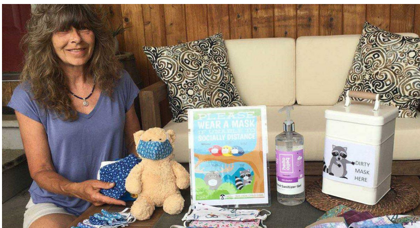
PHOTOS: CHILD CARE DURING COVID-19 AT MOUNTAIN VIEW FAMILY CHILD CARE, NORTH TROY, VT

AND YOU CAN HELP! Join the movement by adding your name, making a gift, or volunteering at www.letsgrowkids.org .