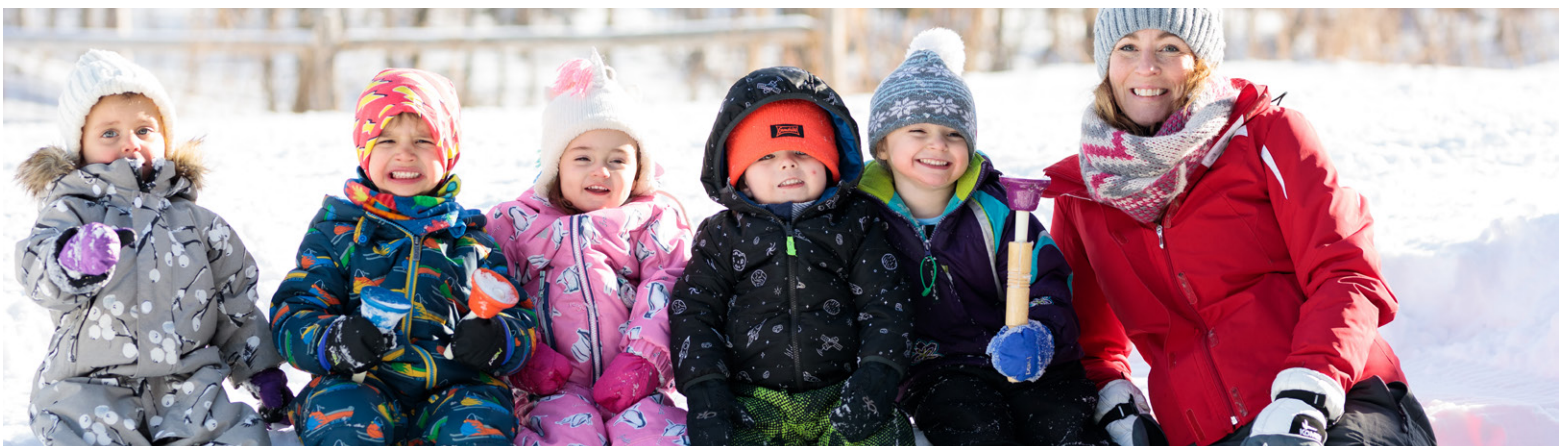
PHOTO: BOLTON VALLEY CHILD CARE, BOLTON VALLEY, VT

READ FULL REPORTS ON CHILD CARE ACCESS AND AVAILABILITY, PLUS WORKFORCE DEMAND, AT: